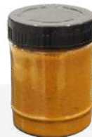
Haleem/Karahi Gosht Masala