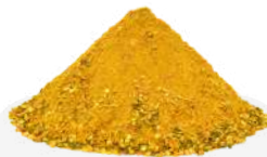
Achar Gosht Masala