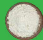
Brown Rice Flour £4.40/kg