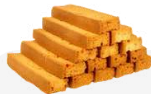
Cake Rusk Large Pack