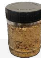
Chapli Kabab/ Fish Masala