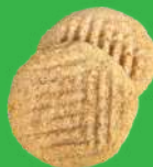
Keto Almond Cookie