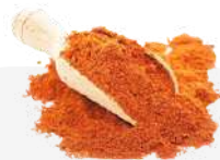
Nihari/Seekh Kabab Masala

grinded in our very own spice milling facility