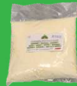
GF Suji/Moong Daal Flour £4.79/kg