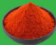
Red Chilli Powder