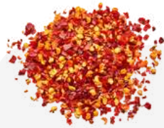
Red Chilli Flakes

grinded in our very own spice milling facility