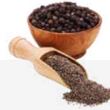
Black Pepper Powder