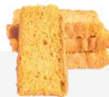
Stearia Cake Rusk