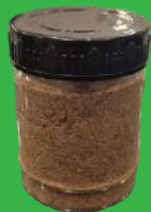
Meat Tenderizer £1.10/60g