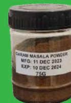
Garam Masala Powder